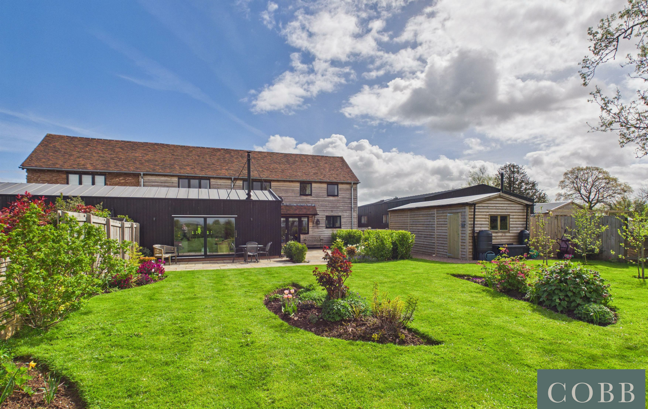
The Cart House, 4 Meadow Bank, Hatfield, HR6 0SG Price £595,000